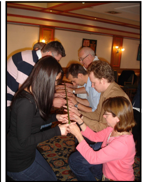
Teamwork in action

In October 2009 twenty-one members of the AntiMal consortium converged on the little village of Les Diablerets in the Swiss Alps for a leadership course. The group was made up from several Institutes across the consortium, including the University of Nairobi, the University of Milan and CNRFP in Burkina Faso. Delegates with a variety of skill sets were each looking for a new way to lead and cultivate their teams.